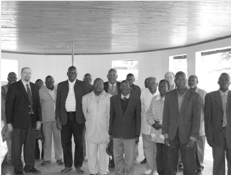
Tribal and Church leaders gather at Lehututu to launch the Shekgalagari Bible Translation Project in September, 2009

We pray that within ten years, the Bakgalagari will have the Bible in their mother-tongue so that their children and their great-grandchildren can hear and read God's Word in their first language.