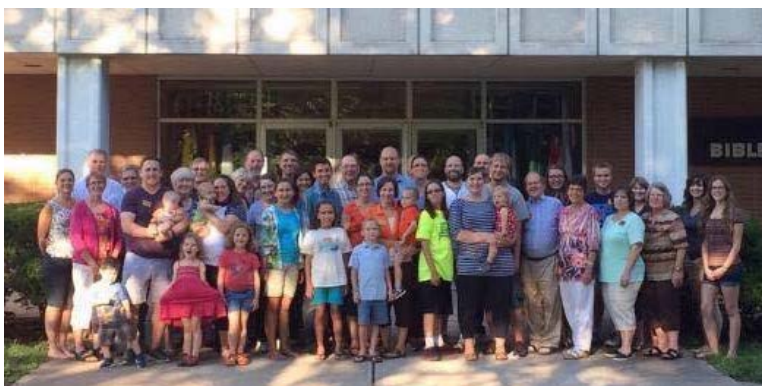
The LBT-U crew in front of the international offices in Concordia.