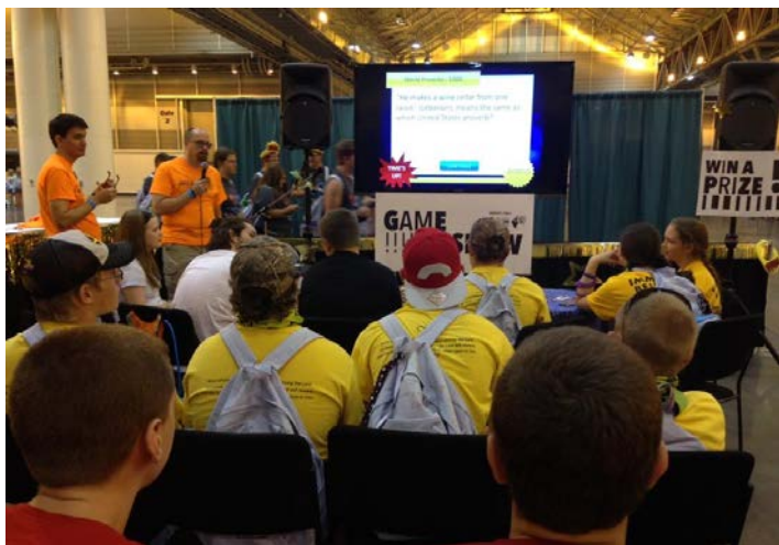
Above: Good times at the Youth Gathering game show, Below: The Translation Station, teaching students how to say 'God loves all people' in the Shekgalagari language

22,000 high school youth from Lutheran Church Missouri Synod congregations across the country gathered in New Orleans with another 5,000 college age Young Adult Volunteers. LBT was there manning an exhibit station, an interest session called Truth AND Dare, a Bible translation / reformation game show and translation station at Wittenberg Castle in the experiential learning center. Thousands stopped by the booth to collect a carabiner with a tag on it requesting prayer for one of the more 4,000 language groups with inadequate access to scripture in their heart language. I (Rich) ran the game show most of the time and was able to draw in lots of participation in a very noisy and full experiential learning center. I might have missed my calling, but I'm not sure. At any rate, it was a nice break from the rigors of administration. LBT launched its snapchat channel at the gathering and significantly multiplied the folks connecting with our ministry through that medium. Youth Gathering was a chance to begin to nurture a relationship with some mission minded youth even now, but also a chance to give back to the church and share some of the experiences that we have gained as LBT missionaries working at the ends of the earth.